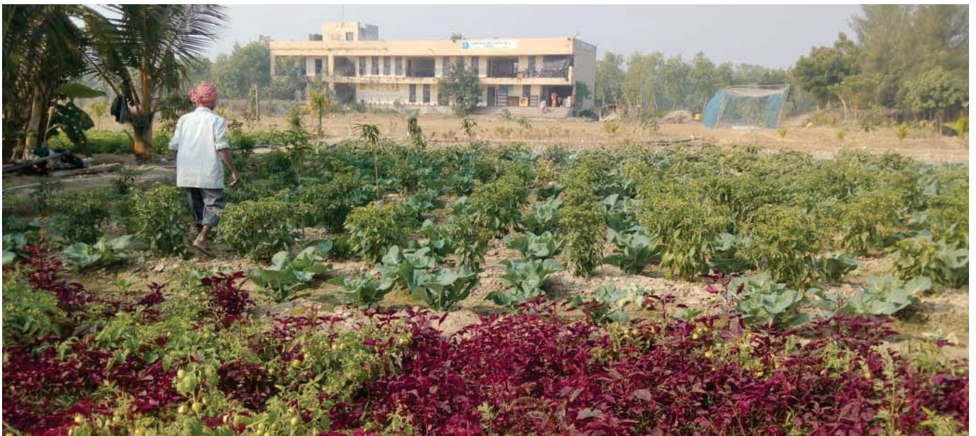
Coconut 64, Mango 65 and Papaya 206 Tree Sapling planting in Sunderbans school completed

A weekly initiative from Rotary Club of Calcutta Visionaries's Free Medical Camp on every Sunday, Total 278 patients were checked during the January, month and Free Medicine were distributed to them by our RCC Sukantapally United Samity