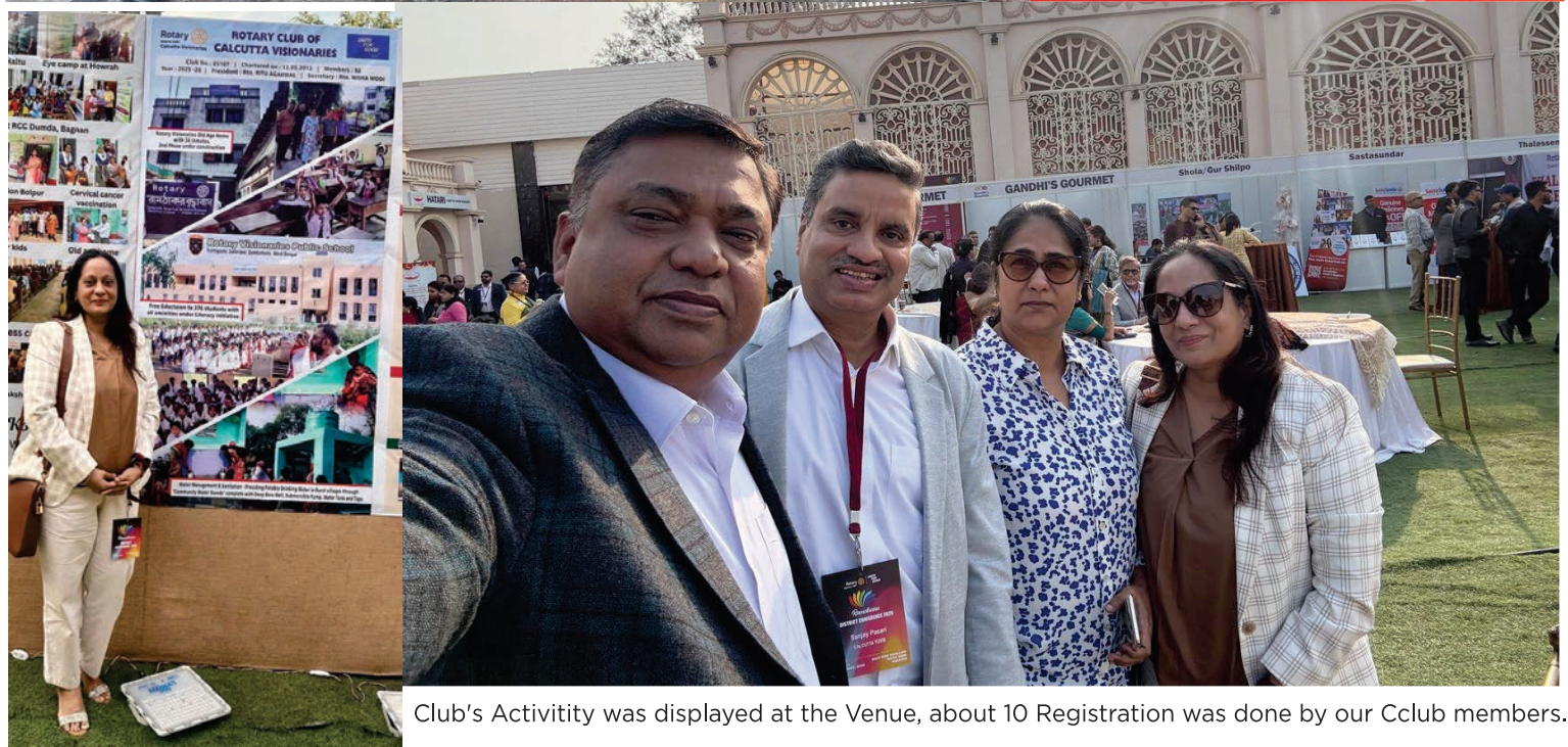
Club's Activity was displayed at the Venue, about 10 Registration was done by our Cclub members.

"WE MEET FORTNIGHTLY ON THURSDAYS AT 7.30 PM AT THE CALCUTTA PUNJAB CLUB FOR OUR REGULAR WEEKLY MEETING"